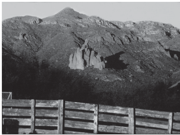
Looking east from the Quarter Circle U Ranch, circa 1950