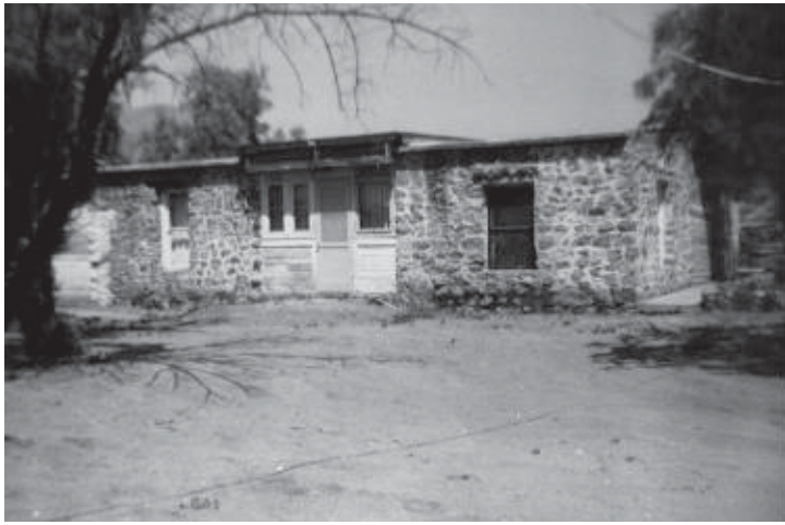
The 3R Ranch near Apache Junction