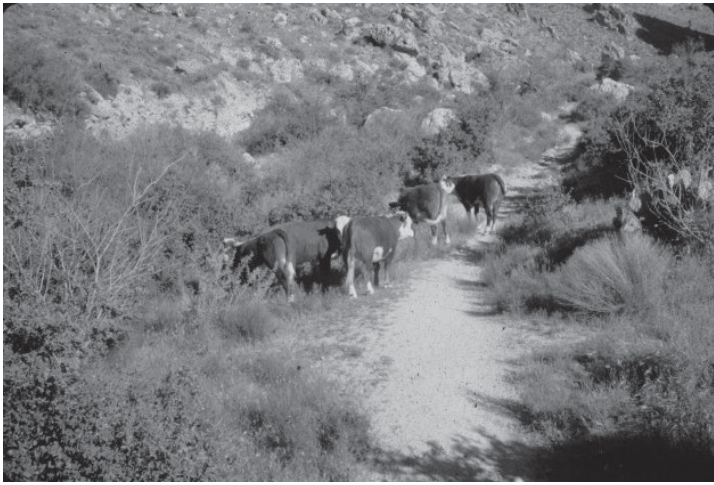
Trailing cattler on the open range.