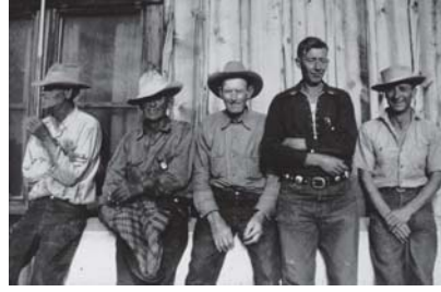
Superstition Range cowboys, circa 1930