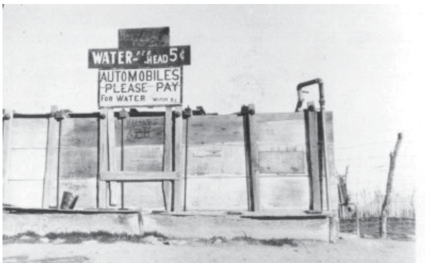
Week's Station on the Apache Trail, circa 1906.