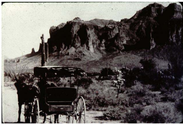
Along the Apache Trail, circa 1906.