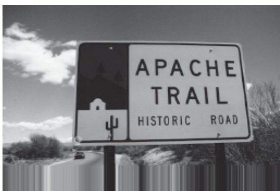
Apache Trail historic marker near Lost Dutchman State Park, 1987.