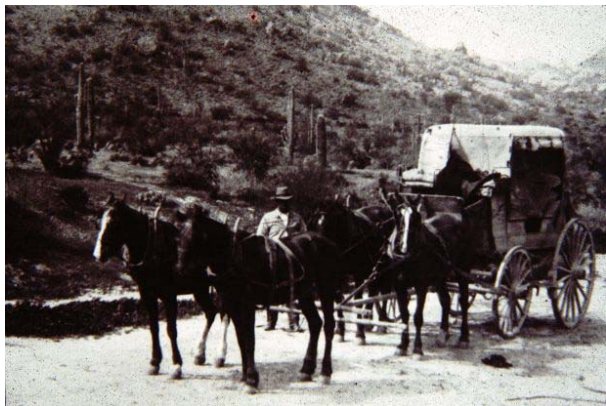
Stagecoach at Government Wells on the Apache Trail, 1905.