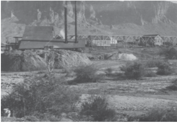
Mammoth Mine & Mill, Goldfield circa 1896-97