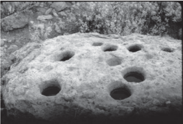
Grinding holes southeast of Superstition Mtn.