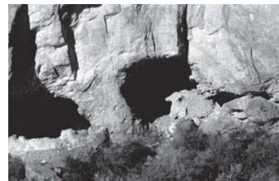
This cave in the Superstition Wilderness has been used by human beings for approximately the past 2000 years.