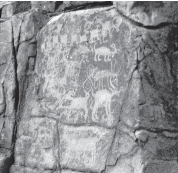
Petroglyphs in Hieroglyphic Canyon.